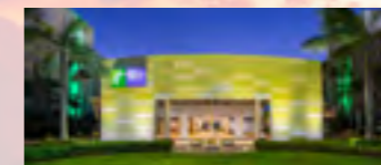
Holiday Inn Aruba