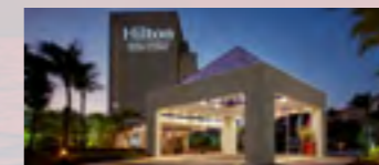
Hilton Aruba Resort