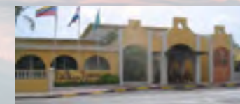
Talk of the Town