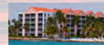
Renaissance Aruba Resort