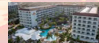
Marriott Aruba Resort