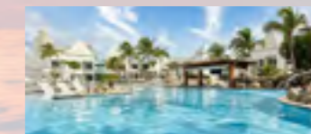
Marriott Courtyard Aruba

Other Lodging Options: [Click or Tap for a curated list of Aruba Resorts]